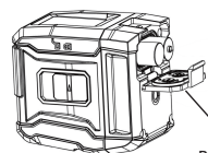
Battery compartment cover